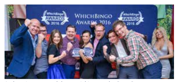
Jackpotjoy team celebrate picking up the Best Gamesys Bingo Site & Best Online Bingo

More photos and video from the event can be found at www.whichbingo.co.uk/awards/