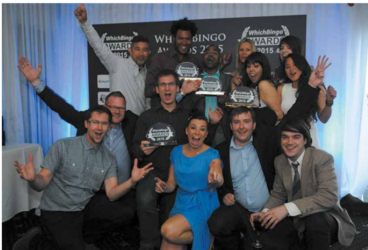
Jackpotjoy and Gamesys enjoying their wins