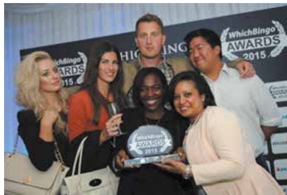
The team behind Betway Bingo