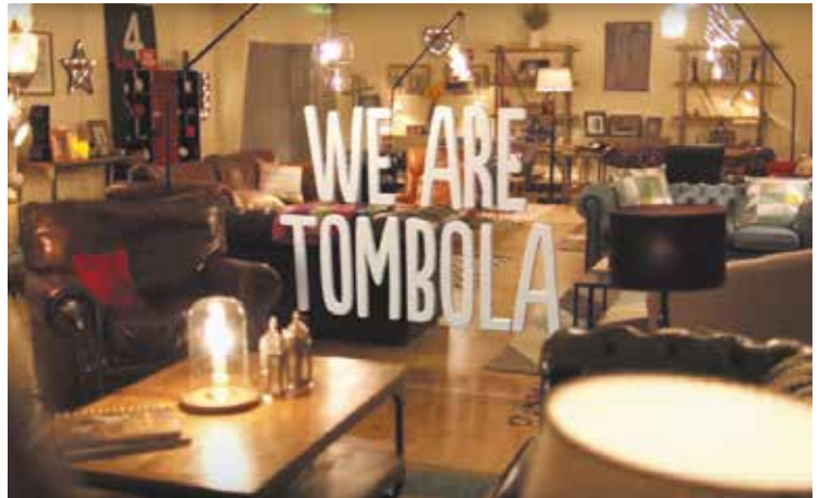
Players and CMs Star in Tombola New TV Advert August 25, 2015

“Winner Bingo probably spent more individually on TV advertising in 2015 than other brands including Gala, Sun, Mecca or Foxy Bingo.”